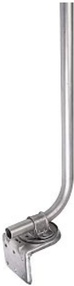
FIGURE 7. The SMMB1 Mounting Bracket

The SMMB2A provides a heavy-duty mounting solution for radio deployments. The SMMB2 is compatible with all Cambium PMP radios, and recommended for all Cambium PMP 400, Cambium PMP 320 Access Points and Cambium PMP 430 Access Points.